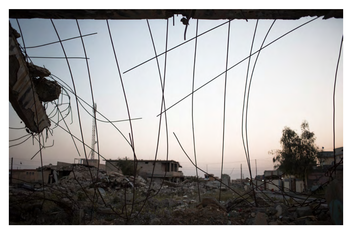
A house in Sinjar city totally destroyed during the fighting in 2017. In some buildings, unexploded rockets and booby-traps remain.

enter contaminated land pressured by the need to earn an income. While research has shown that women's access to employment in conflictaffected areas is very limited, men are reportedly