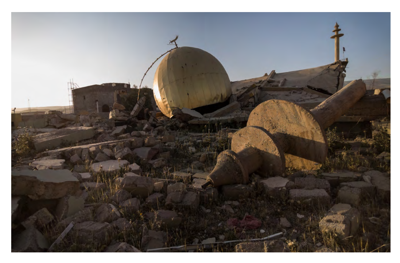
In Sinjar, Mosque destroyed and booby-trapped by ISIS.