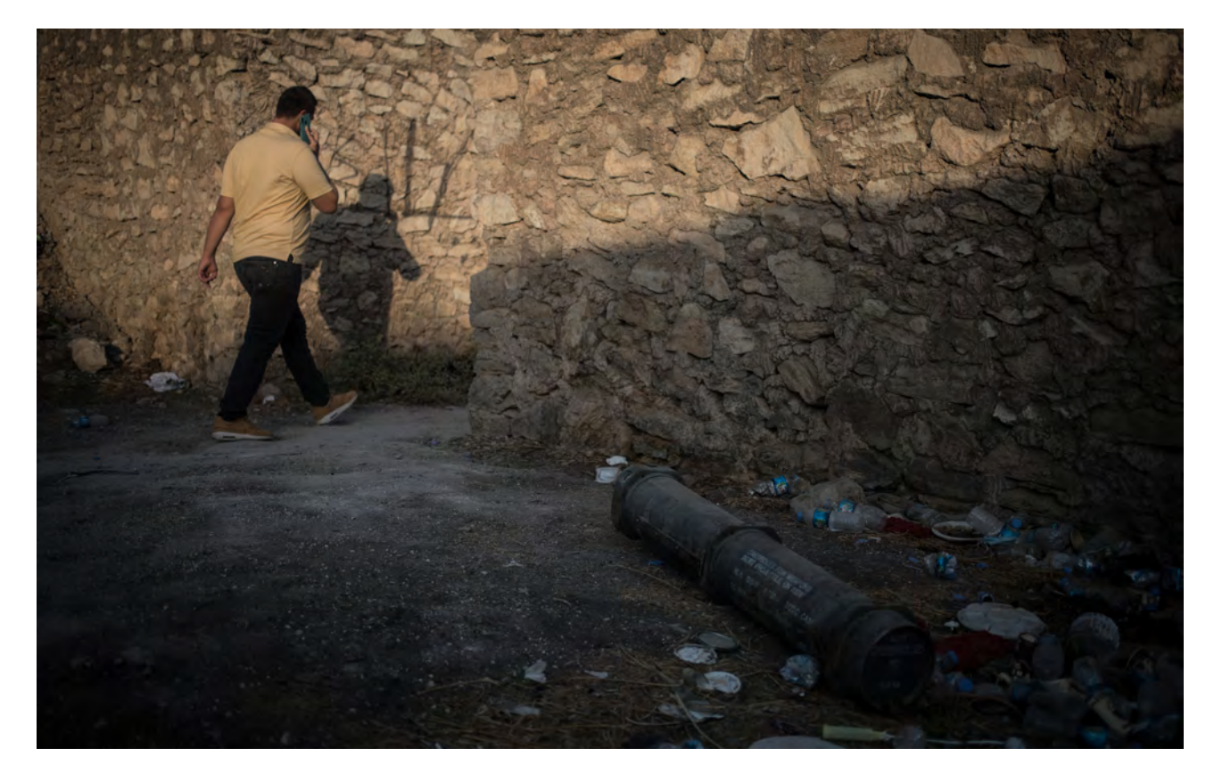
A civilian is passing by a munition case left on the ground in a street of Mosul.

(i.e. number of devices cleared, and number of square metres cleared), to effectively measure the impact on affected people's lives, such as the