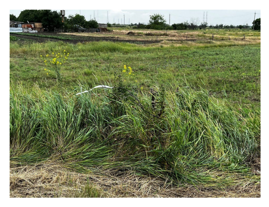
Caption: Markings of suspected mine fields in Snihurvka, June 2023.

According to the Global Agricultural Information Network, cited by UNOCHA, "over half of Ukraine's 14.7 million households are involved in small-scale agricultural production, and 8.3 million households provide for the food needs of their families and communities."<sup>23</sup> Furthermore, according to the Food and Agriculture Organization (FAO), the war has created obstacles for food access and exacerbated the vulnerability of rural food systems . Additionally, UNOCHA notes that the lack of income generation, disruption of critical services, displacement, and the adoption of negative coping mechanisms to access food and supplies continue to pose threats to the civilian population, including a threat to food and livelihood security both in Ukraine and internationally.<sup>24</sup> Indeed, the termination of the Black Sea Grain Initiative in July 2023 saw an increase in attacks on ports and grain facilities, impacting civilians in the area as well as agriculture exports. Prior to the war, agriculture in Ukraine accounted for ten percent of the country's GDP and generated 41% of total exports.<sup>25</sup> In 2023, researched showed there was a 40% reduction in the winter crop harvest.<sup>26</sup>