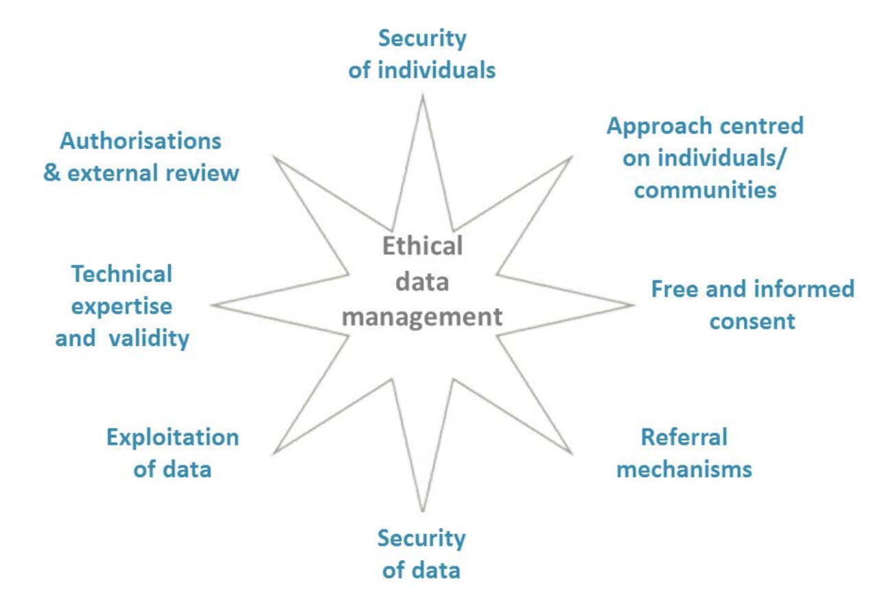
Figure 2 - Eight recommendations for the ethical management of data in studies and research at Handicap International

These recommendations are not exclusive of each other; they are interdependent.