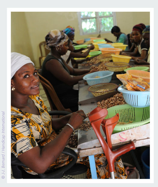
Employees with and without disabilities working together. Senegal, 2010.

Identified problems: Lack of employment opportunities (up to 60% of overall unemployment); lack of knowledge on the part of employers on how to make their services accessible to, & inclusive of , PwD (in particular, disabled poor women) in the mine-affected region of Casamance.