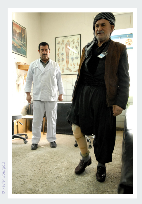
KORD center, Souleymaniah, Iraq, 2011.

Identified problems: Most mine/ERW casualties live in rural areas, yet most doctors and medical facilities are located in cities. In Northern Iraq, there was little capacity to provide pre-hospital care for victims of trauma.