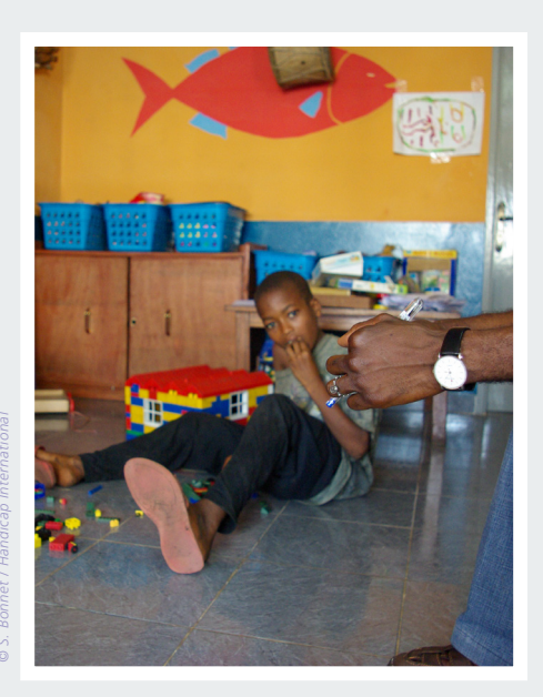
Freetown, City Center, Sierra Leone, 2007.

Identified problem: CwD face physical, attitudinal & communication barriers to attend and remain in school. Main objectives: 1.To reinforce the capacities of teachers & other education service providers to include CwD in their programs 2. To increase the awareness of the families of CwD on the benefit of education for their child. Activities: 1. Capacity building of teachers & other relevant stakeholders to improve the quality of instruction for CwD. 2. Promotion of a more active role of DPOs in inclusive education. 3. Awareness raising activities among families of CwD. 4. Technical support for schools to develop or improve accessibility features, adapted equipment & training materials. 5. Identification & dissemination of lessons learned & best practices with the Ministry of Education and USAID to promote upscale & replication. Sustainability: Project based on the national & regional education system & schools. It trains government Education officials, local teachers & DPO members so they have improved knowledge & skills beyond project duration. It ensures linkages with the Ministry of Education and will disseminate lessons learned & good