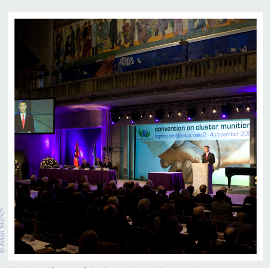
Signing conference of the Convention on Cluster Munitions, Oslo, 3rd December 2008.

The project: HI implemented a four-year project from 2009-2012 which promoted South-South cooperation on VA in Asia & South East Asia, the Middle East, Central & East Africa and Central Asia. Four regional VA workshops were organized to raise awareness on VA & disability more broadly, increase knowledge on how to develop a national action plan on VA/disability, and to provide a platform by which affected & donor states could exchange on best practices and capitalize on opportunities. These workshops were joined by all relevant stakeholders from a given region, namely representatives from Ministries and Mine Action Centers from mine/ERW affected countries; representatives from countries committed to international cooperation, regional organizations, DPO & survivor organizations, the ICRC, UN agencies, the ILO, ITF, the GICHD, the ICBL & the CMC. These regional workshops were organized in Bangkok, Amman, Nairobi, Dushanbe & Vientiane.