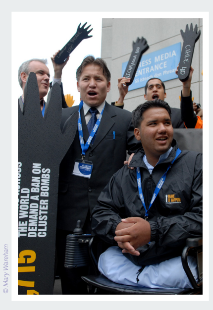
Ban advocates and campaigners at a Conference on Cluster Munitions, Dublin, 2008

"Ban advocates" (BA) is an advocacy group of cluster munitions victims from 12 countries. It started in 2007 with the support of HI.