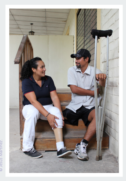
Peer support in El Salvador, Red de Sobrevivientes y PcD

Identified problem: Social exclusion and extreme poverty of PwD & their families, including survivors of armed conflict. Programs implemented by 'the Red': 1. Access to Health: promotion of mental health (self-esteem & self-management), rehabilitation (mobility devices), and prevention (nutrition, preventing infectious disease). 2. Support for Decent Work: business training & seed capital. 3. Promotion of Social empowerment: training on disability & human rights, leadership, advocacy & legal frameworks; strengthening of community-based organizations & awareness-raising at national level.