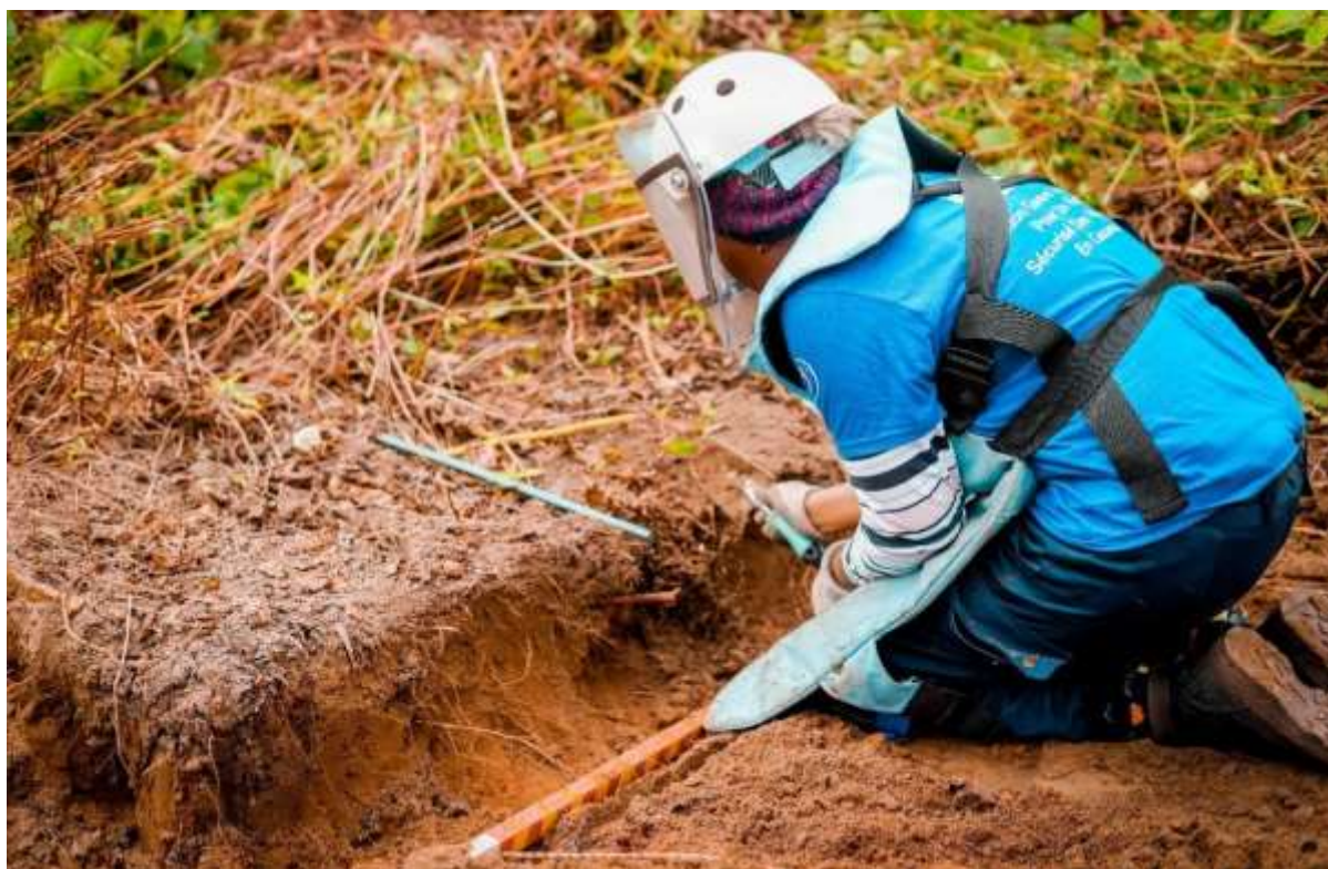
Manual clearance (full excavation process) in Kouring, October 2023.