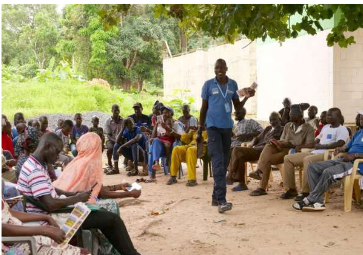
Awareness raising session on the risks of explosive ordnance delivered by HI's community liaison team as part of land release activities in Kouring, July 2023.